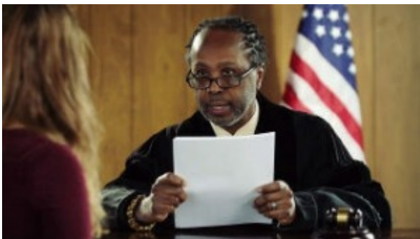
Vídeo: Preserving the Record on Appeal, 5:33