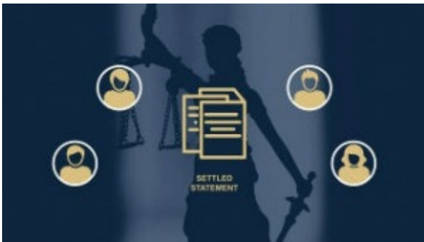
Vídeo: If you Can't Get a Reporter's Transcript, 5:18