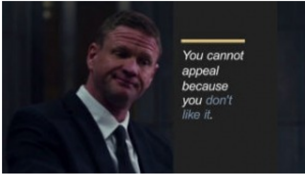
Video: To Appeal or Not to Appeal, 6:29