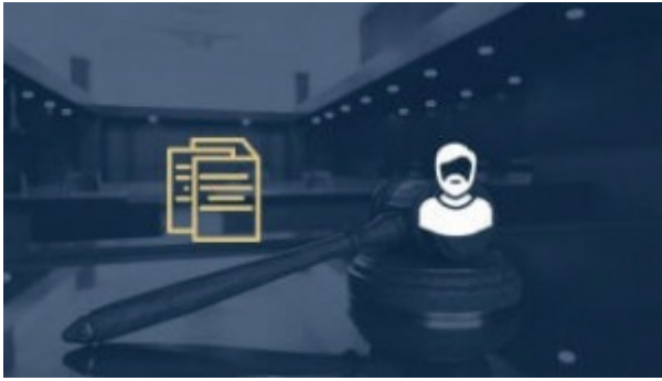
Vídeo: What is a Brief?, 4:27