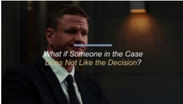
Video: Judicial Branch Overview, 8:00