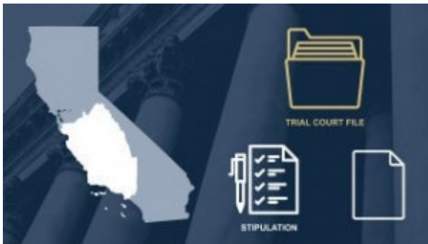
Video: Designating the Record for Appellants, 15:51